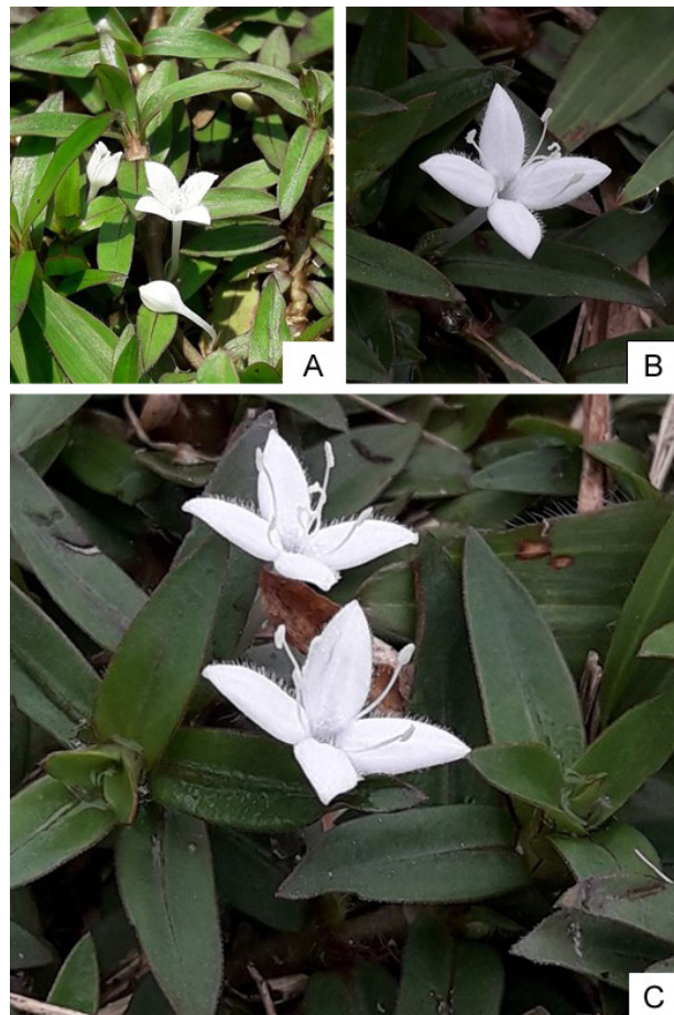
Figure 2. Diodia kuntzei A. Habit and details of margins and reddish veins of leaves. B, C. Details of inflorescence: flowers with pilose lobes and exerted stamens.

Amazonas: Careiro, Rio Solimões, South bank, 10 km E of Boca de Janaucá, 3 Oct. 1973, Berg, C.C. 17589.0 (NY1061132). • Amazonas: Boca do paraná do Cambixe,