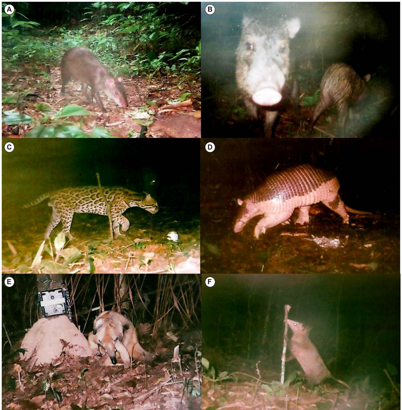
FIGURE 2. Some mammals at the Humaitá Forest Reserve (HFR) that were photographed using camera traps. A: Dasyprocta fuliginosa . B: Pecari tajacu . C: Leopardus pardalis . D: Priodontes maximus . E: Tamandua tetradactyla . F: Didelphis marsupialis .

Studies that calculate relative abundance in the Amazon are still scarce (Martins et al. 2007; Tobler et al. 2008; Negrões et al. 2011). A comparison between our study and the study of Tobler et al. (2008), in southeastern Peru (table 2), shows three species ( Cuniculus paca , Dasyprocta fuliginosa and Leopardus pardalis ) with relative abundance noticeably superior to that found in HFR. Despite the fact that these significant differences may be due to fragmentation and hunting effects in the HFR (Chiarello 1999; Cullen et al. 2000; Cullen et al. 2001; Peres 2001), extrapolations from studies that are based on the relative abundance obtained from camera traps are not recommended because of the lack of standardization