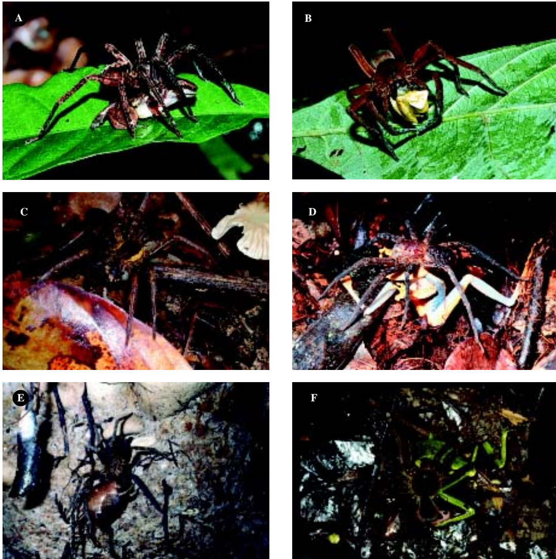
Figure 1 - Spider Ctenus amphora eating a female Colostethus stepheni (A); Ancylometes rufus eating an adult Dendropsophus minutus (B), Adenomera andreae (C) and Hypsiboas geographicus (D); Ancylometes sp. eating an adult Hamptophryne boliviana (E); therapsid spider eating an adult Phyllomedusa vaillanti (F).

1993, Höfer et al. 1994). Although most reports on attacks of amphibians by spiders in literature do not show the capture of the prey, our observations and those of other researchers indicate that predation is an important source of