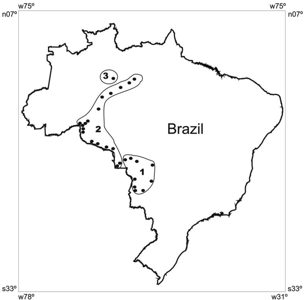
Figure 1. Locations of survey in three sites, around the Pantanal (1), in the Guaporé-Madeira (2) and Amazon Rivers (3), Brazil.

Snout-vent length (SVL; in cm) of all animals captured was measured and animals were weighed with a spring balance accurate to 1 g for animals up to 600 g, and accurate to 0.5 kg for larger animals. Age of hatchlings was estimated from the time