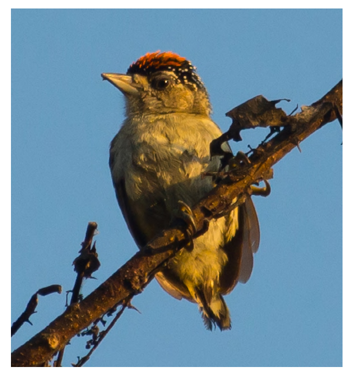
Figure 2. Adult male Fine-barred Piculet, Picumnus subtilis, at Jarinal.

On 19 August 2014, minutes after we recorded the Picum-nus subtilis family reported above, we heard the calls of a Hemitriccus cohnhafti at the same road-side patch of bamboo. After playback we got only a brief glimpse of the bird as it