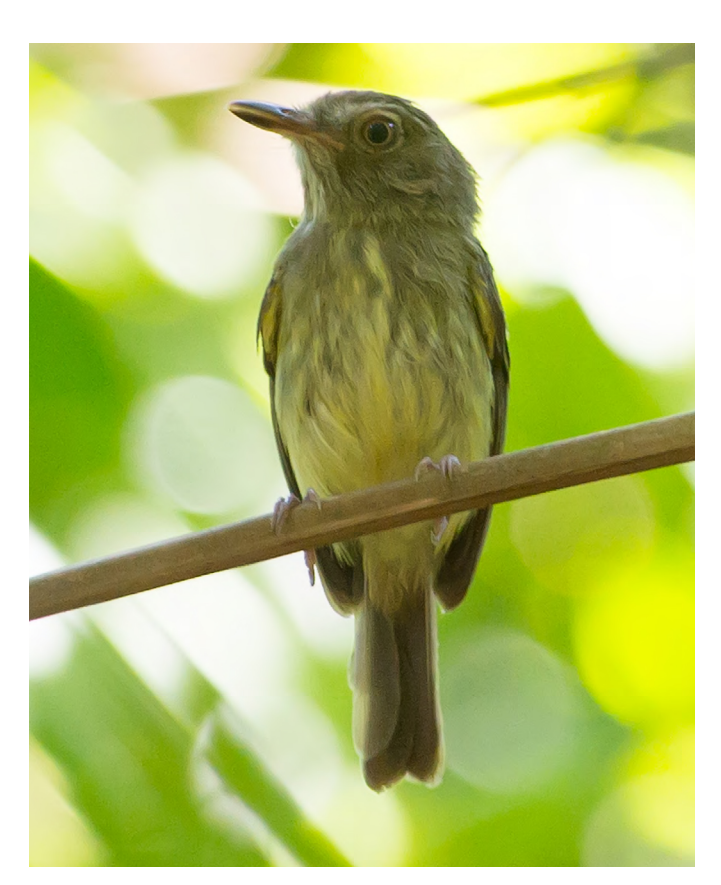
Figure 3. Acre Tody-tyrant Hemitriccus cohnhafti at Jarinal.