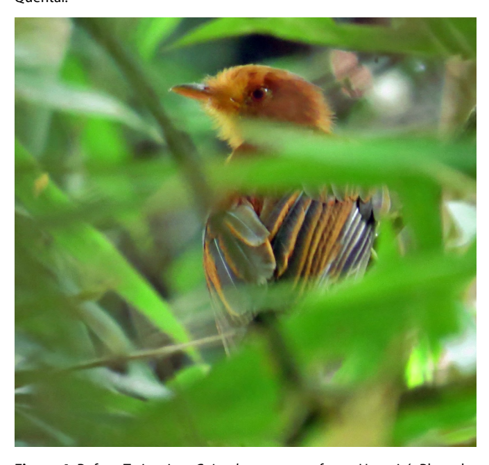
Figure 4. Rufous Twistwing, Cnipodectes superrufus , at Humaitá.

espacial de cinco espécies madeireiras exploradas no Estado do Acre, Brasil. Scientia Forestalis 39(92): 489–499 (http://www.ipef.br/publicacoes/scientia/nr92/cap12.pdf).